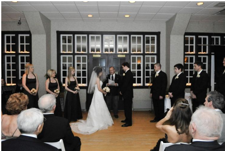
The Rotation Gallery Capacity 80 people

Terrace would be honored to host your wedding ceremony on our Terrace or the 2 nd floor Rotation Gallery.