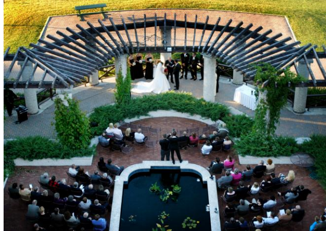
The Terrace Capacity 120 people (Seasonal)